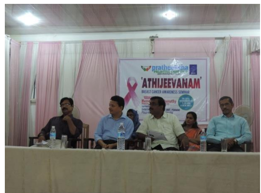
Fig: Inauguration of Breast cancer awareness seminar ‘Athijeevanam