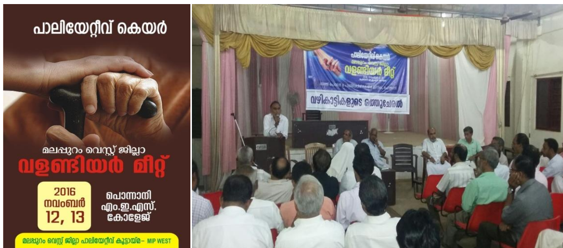
Fig; A glimpse from the Malappuram District Palliative Vollunteer meet.