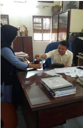
Fig: Inauguration of 'One day One Rupee for One life Campaign' by Principal